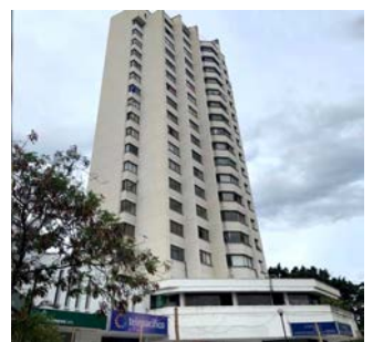
Beneficencia Del Valle (Colombia 6 units)