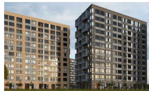
City Park Yaroslavl (Russia 18 units)