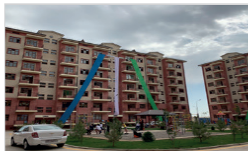
Government affordable houses (Uzbekistan 689 units)