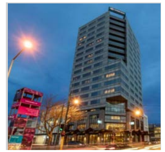
Crowne Plaza Hotel (New Zealand 5 units)