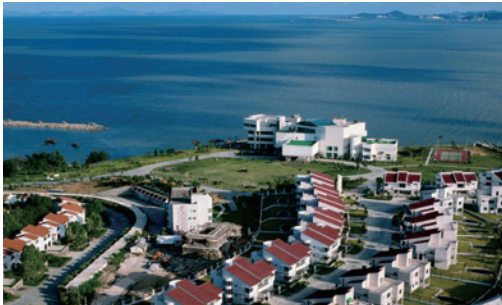
Desa Hill Villa Area (Malaysia 426 units)

Joylive is providing landmark buildings around the world with its best products and is maintaining them in top condition. Whether installed in a small two-story commercial building or in a skyscraper in a major city, Joylive elevator and escalator, modernization, industry leading destination control and maintenance solutions are unsurpassed.