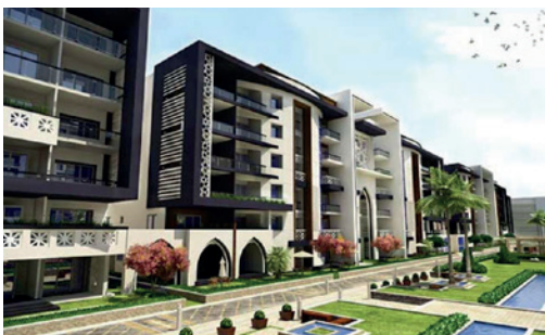
Korba Heights (Egypt 12 units)