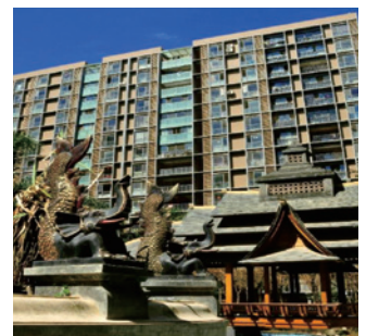
Agung Sedayu (Indonesia 13 units)