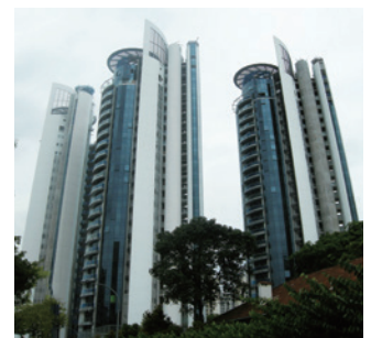
Residential complex (Singapore 23 units)