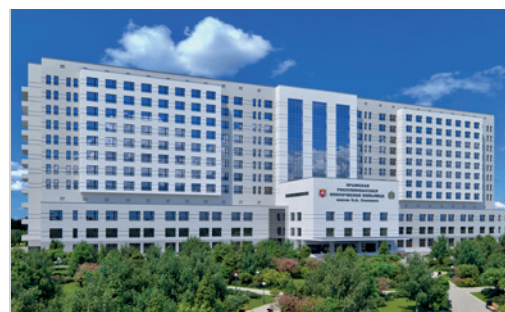
Crimean Clinical Hospital (Russia 14 units)