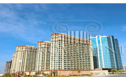
International Media Production Zone (Dubai 12 units)