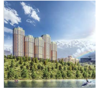
Lake Town Apart, Almaty (Kazakhstan 18 units)