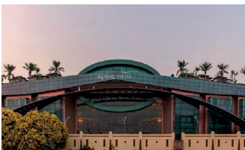
Royal Swiss Lahore (Pakistan 11 units)