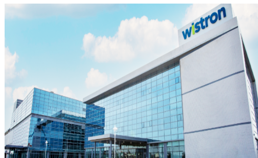
WISTRON INFOCOMM (Vietnam 36 units)