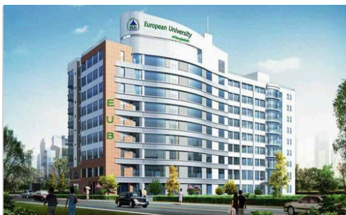
European University of Bangladesh (EUB) – 34 units